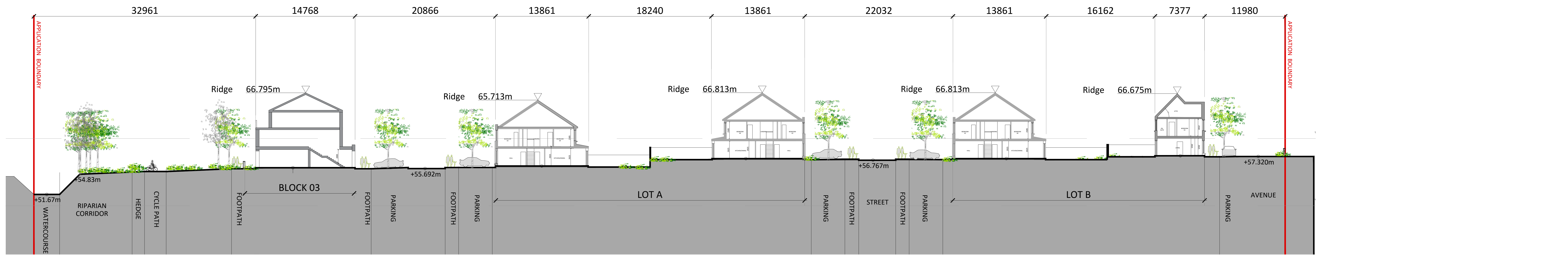
SECTION E-E: 1:200