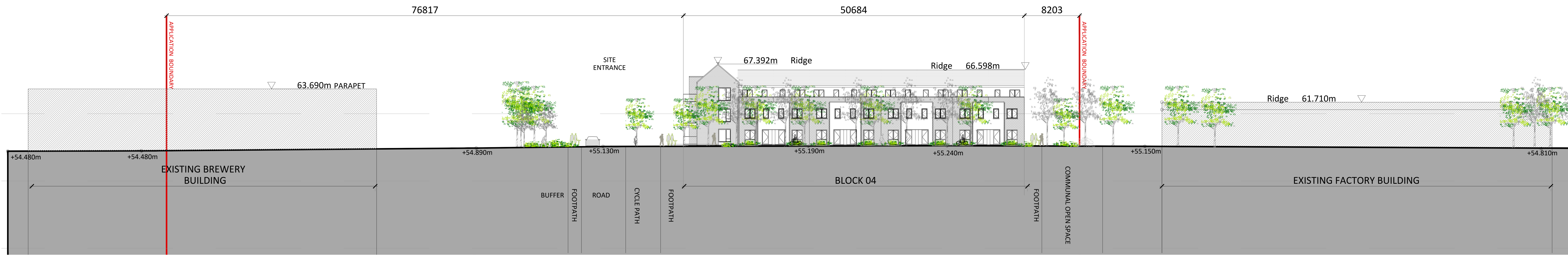
PROPOSED STREET ELEVATION - DUBLIN ROAD SECTION D-D: 1:200